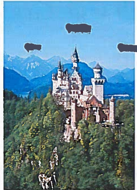
The fairy tale castle of Neuschwanstein in the Bavarian Alps