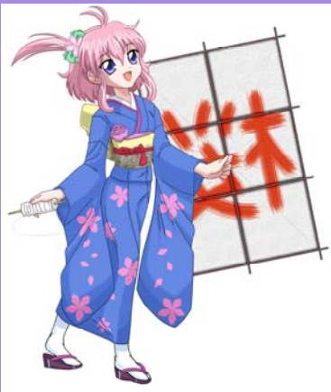
3 rd place winner

The winning 2007 Mascot entry, as featured on the front of this newsletter