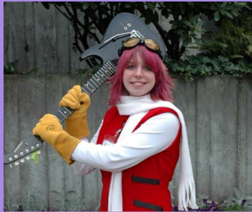
Anyone feel up to discussing the symbolism in FLCL?

Panels are one of the greatest things about any convention. They provide a place for a group of dedicated fans to host a discussion; teaching others and learning in the process. We are proud of the Sakura-Con panels of the past and are looking forward to the creative and exciting mix our members cook up for this 2007 convention year! If you have an idea for a panel (whether you want to run it or would just like to attend it), please get in touch with us as soon as possible. It takes time to research and fill requests. Contact panels@sakuracon.org or programming@sakuracon.org .