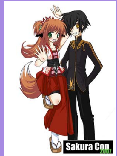
2 nd place winner